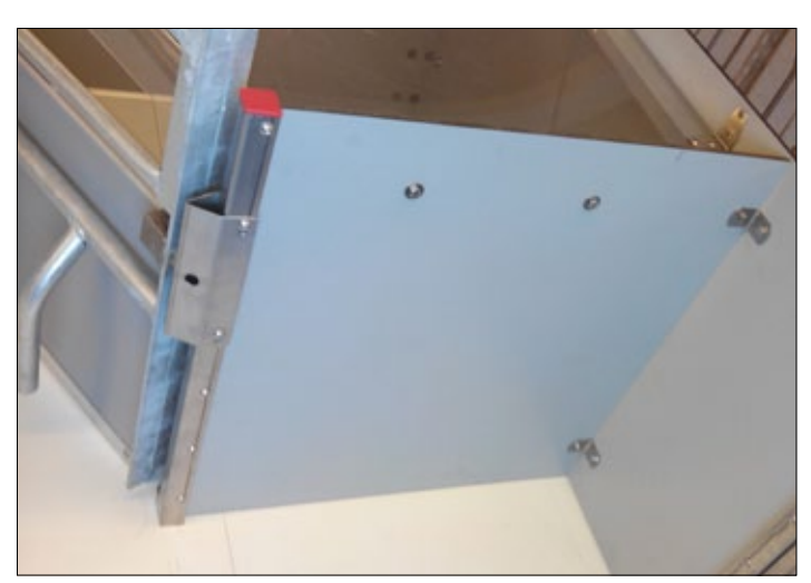
The FT-30 pen can be made of 10 mm fiber plates.

Subject to changes in materials and design reserved.