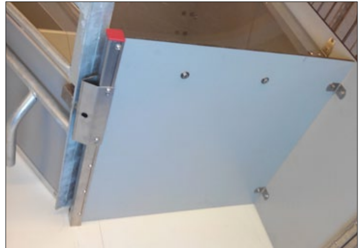
The FT-30 pen can be made of 10 mm fiber plates.

Subject to changes in materials and design reserved.