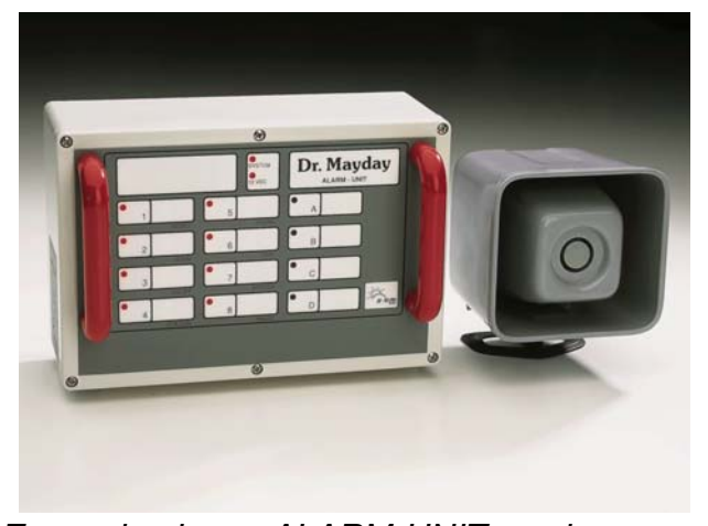
Expansion by an ALARM-UNIT serving 8 ON/OFF inputs and 4 outputs.